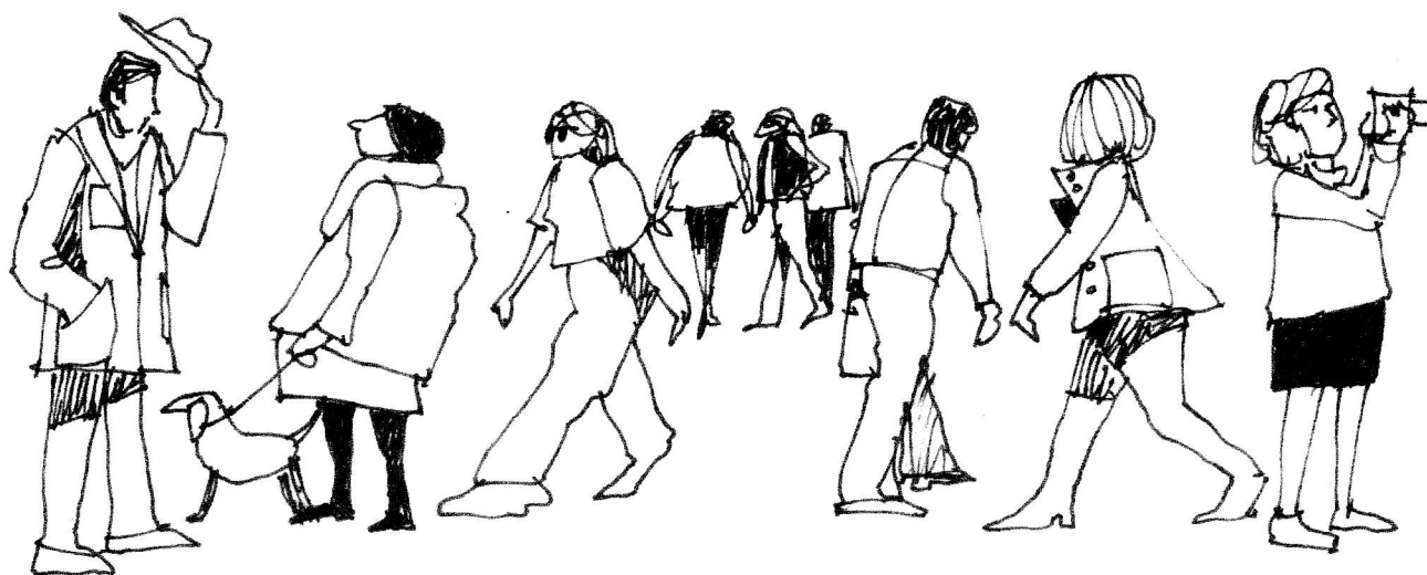
Figure 3.7 Through careful observation and sketching of people on location, the simplified techniques described here can be adapted to give figures individuality and attitude.